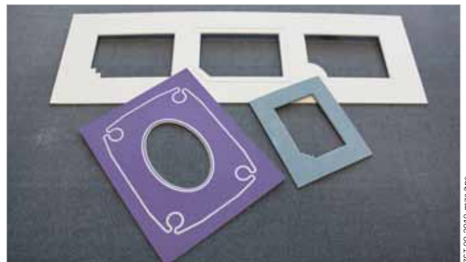
Application: cut mats for picture framing.